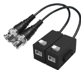
PFM800-E Passive HDCVI Balun