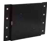
Prism Mount Plate PN 1030-000