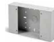
Back Box PN 1260-000