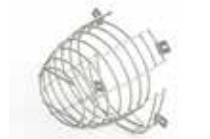
Protective Cage PN 1100-000