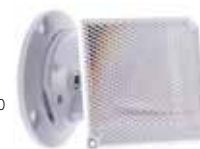
Universal Wall Bracket PN 1040-000